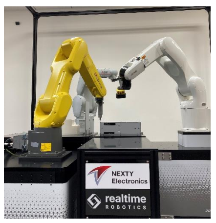
Three robots working in collaboration

[Company Overview] ■ About NEXTY Electronics