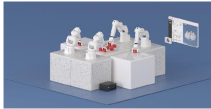
Robot systems that greatly reduce time-to-market and improve work efficiency